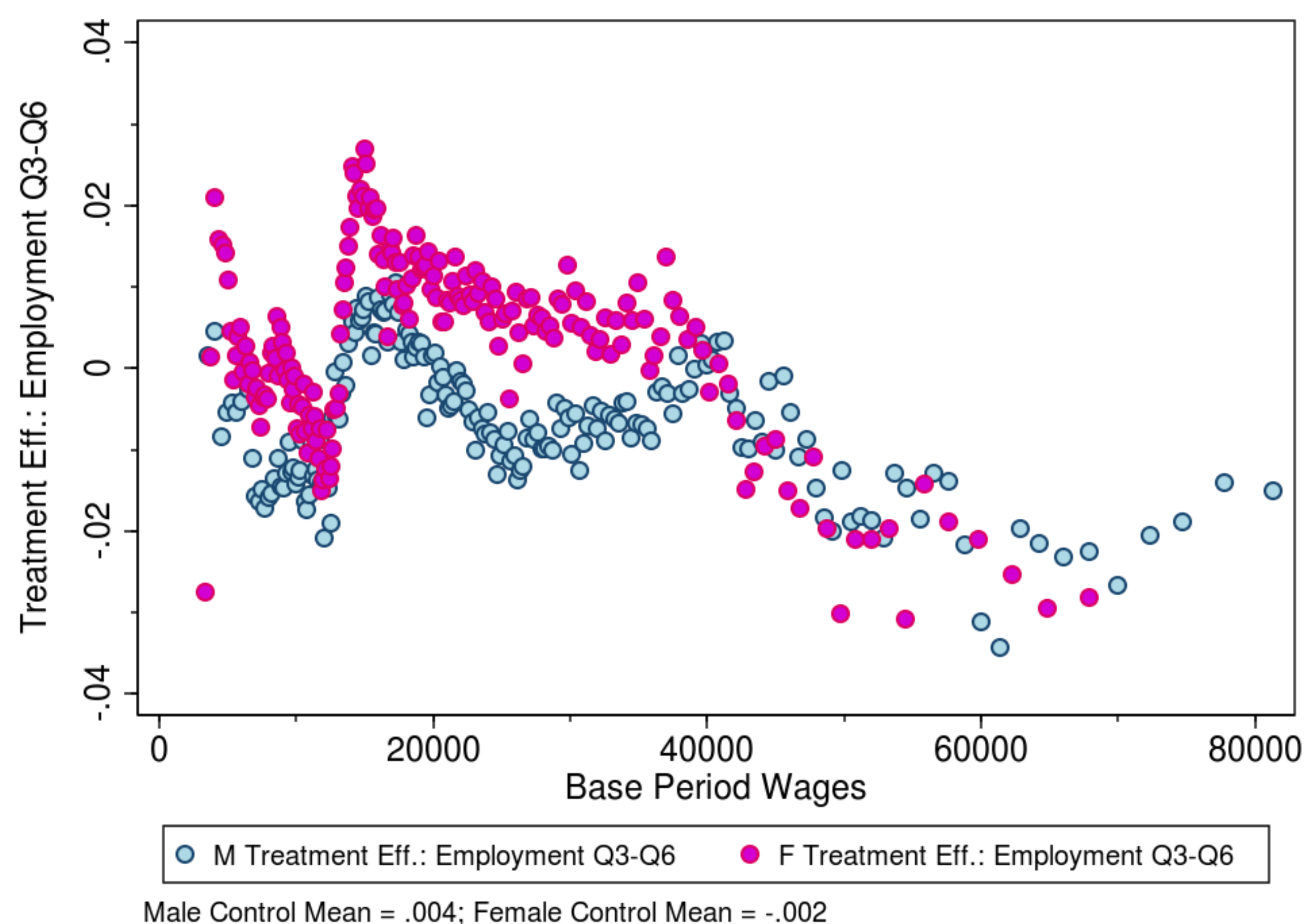
Figure 3: Predicted treatment effect on long-term employment, by income and gender